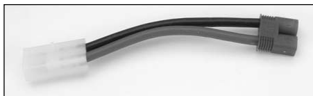
DYN5001 Charge Adapter Tamiya Female: EC3 Female