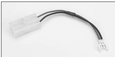
DYN5003 Charge Adapter Tamiya Female: Losi Micro