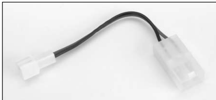
DYN5004 Charge Adapter Tamiya Female to Losi Mini