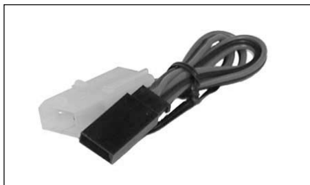
DYN4003 Receiver Pack Charger Adapter

The Passport DC Li-Po 6S Charger includes the Deans Ultra Style Charge Cord (DYN5006) and banana to BEC charge cord. Dynamite offers charge cords and adapters for all your battery charging requirements. See the list below to order additional connectors.