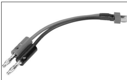
DYN5006 Charge Adapter Banana: Deans Ultra Male