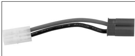
DYN5002 Charge Adapter Tamiya Female: EC5 Female