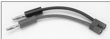
DYN5007 Charge Adapter Banana: EC3 Female