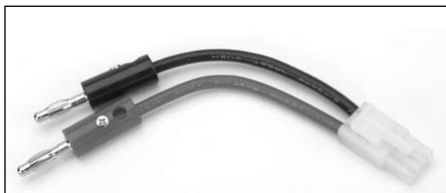
DYN5005 Charge Adapter Banana to Tamiya Male